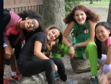
Academy Instructor & Student